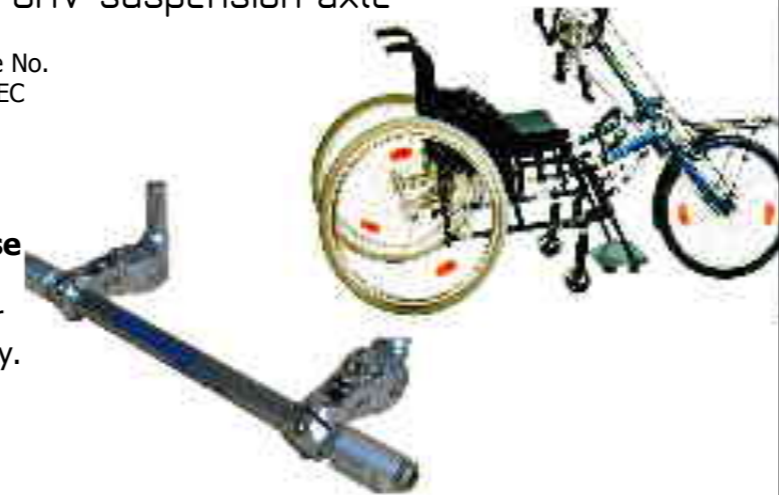
GRV suspension axle

Providing access on sand, snow and mud. Use together with hand cycle or ElectrolomoNT for maximum mobility. Contact us for further information